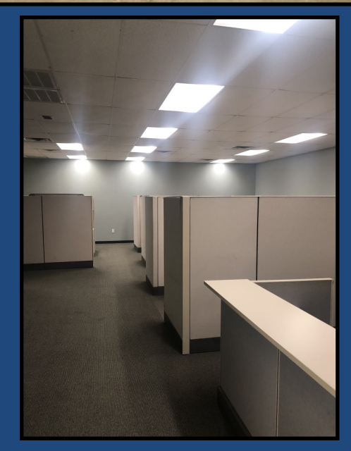
The information contained herein was obtained from sources believed to be reliable; however, Landbridge Commercial Properties makes no guarantees, warranties or representations as to completeness or accuracy thereof. The presentations of this property for sale, rent, or exchange is subject to errors, omissions, change of price or conditions of prior sale or lease, or withdrawal without notice.