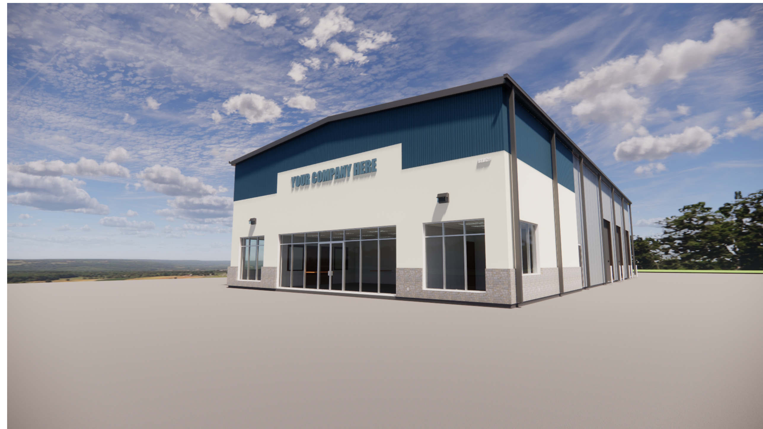
ISOMETRIC 2022-02-03-18-22-37 (Enscape) 4 1/2" = 1'-0"